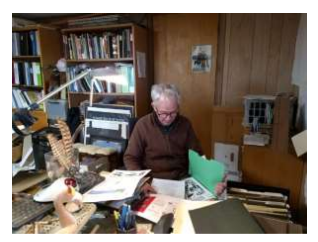
And who says that we don't know how to have fun?!

Despite our more leisurely schedule, we were hustling around trying to keep pipes from freezing, animals from freezing, and just about everything else from freezing! That was a VERY cold snap over Christmas!