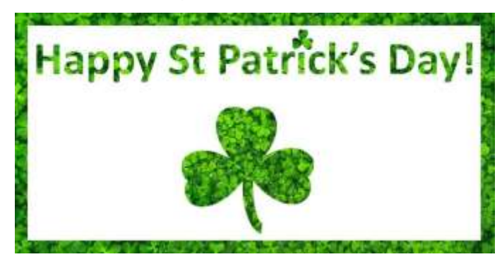
Until next week, Cheryl & Ray