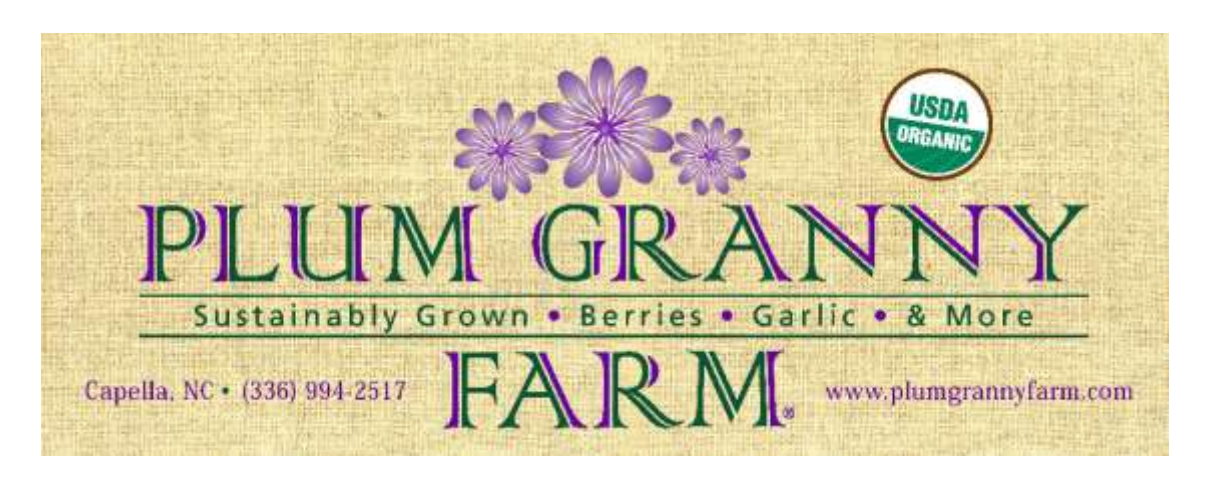
Happy Friday, Farm Friends!