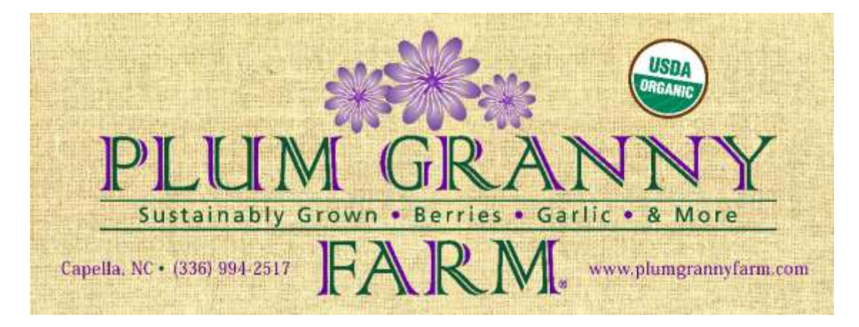
Happy Friday, Farm Friends! Welcome June!