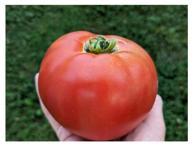
We look forward to seeing you under the Purple tent tomorrow. You HAVE to come see what we've got in store for you!

And, no trick, we'll have TOMATOES ! Yes, in the last weekend of October, we'll have a great selection of heirloom and fruit tomatoes for you. You'd better get 'em while you can!