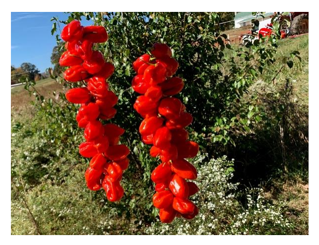
We're not just about peppers. We'll have delicious Sweet Potatoes , our famous Potato Bar along with Garlic Powder and Granules.