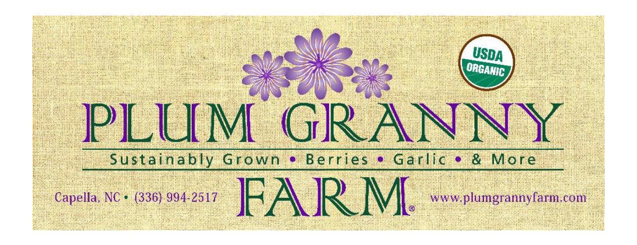
Happy New Year, Farm Friends! Happy Friday!