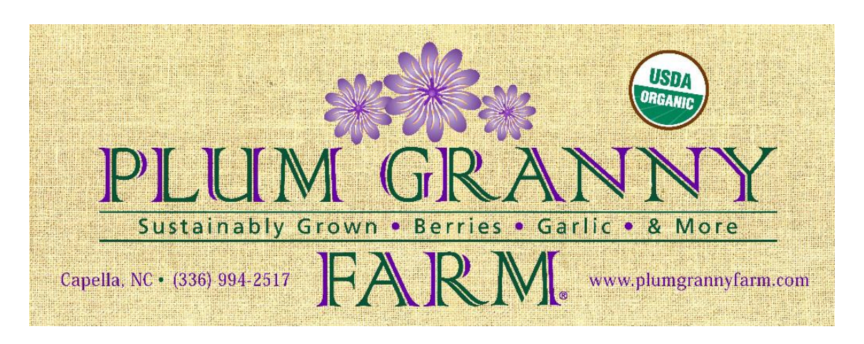
Happy Friday, Farm Friends!

We will be back at Cobblestone Farmers Market tomorrow with lots of great Organic goodies! A plethora of Sweet Peppers! Tomato Fruit Boxes! and more... See all the details below.