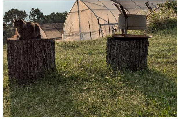
Look for more details on what we'll have available at the Fall Plant Sale (September 6 & 7) in next week's newsletter!

They are totally clueless about the relationship of paws to seed trays. Walking on them seems to be perfectly natural and those big fluffy tails were just meant for dusting off seeds, right? I am trying to get Detroit to take on training duties, but he seems to not be interested in the assignment.