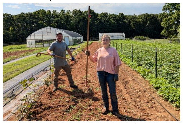
So we keep marching on through the fields trying to catch up, but with the recent (welcome!) rain, they've just been growing like ...well, weeds!

The pests are also testing our patience. This seems to be the year of the whitefly (and aphid, and spider mite...). In one of our high tunnels (Ajo), we had an explosion of whitefly in the first squash crop. Clouds of them would swirl around the plants and they were completely out of control.