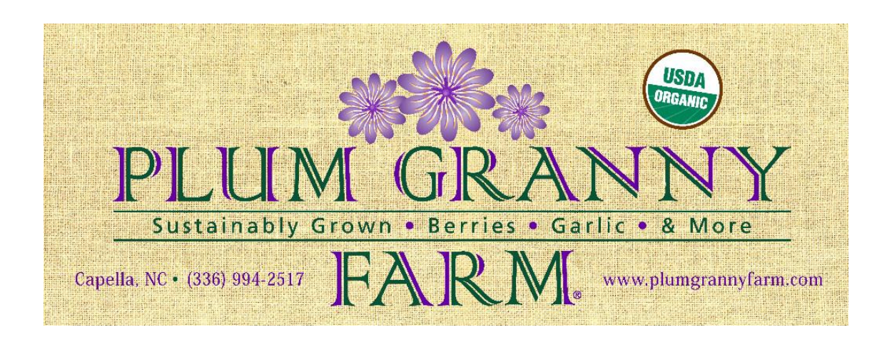
Happy Friday, Farm Friends!

So many late Summer favorites under the Purple Tent TOMORROW (8/24)! Potatoes, Eggplant, Okra, Tomatoes, Sweet Peppers, Green Chile, Baby Summer Squash and MORE! Details Below.