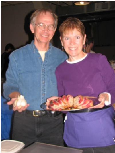
From our first market at Krankies in September 2009

We kept on adding more markets to our repertoire. We occasionally participated at the Dixie Classic Farmers Market that year. And then we made our first appearance at the Krankies Farmers Market on September 29, just a few months after that market was begun by the Triad Buying Co-op. The market was housed inside Krankies!