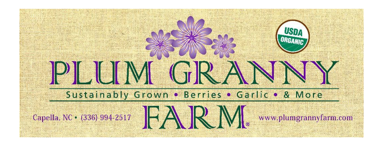
Happy Saturday, Farm Friends! Farewell February! Hello March!